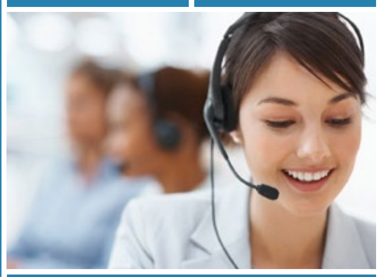
From registering visitors to controlling visits, work at the reception is made easy using Advisor Management software. The receptionist can guide visits, provide access to certain locations and monitor by video whenever needed. If the building should need to be evacuated, based on the floor plan and presence of people in the building, the actions required can be taken immediately.