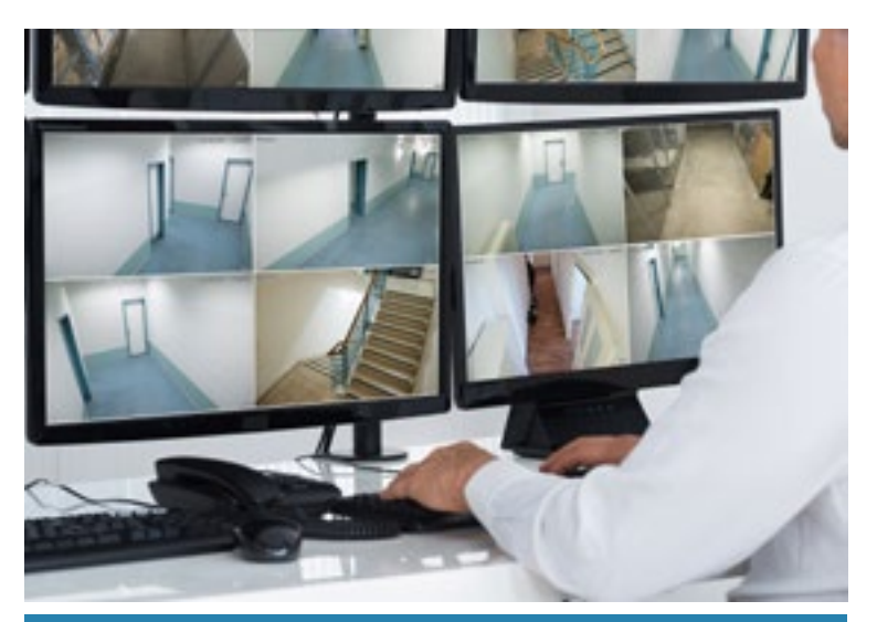
The security manager is in control and able to handle every event. Whenever an alarm is generated, it can immediately be supported by video, which can be retrieved easily at any time. One database for all functions linked to events, where access rights can be altered, is eliminating all chances for error.

The Advisor Management software allows a specific user to gain access where required using the same or unique ID. All this is possible without having to add the user to each site or ID.